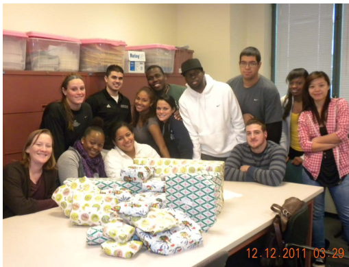
LIU Athletic Training Student Club